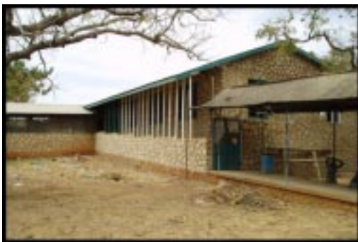
The newly constructed pediatric unit.