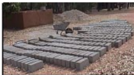
Handmade bricks—the start of the pediatric ward expansion.

The George Faile Foundation continues to raise money in support of BMC and its important mission in providing much needed medical and spiritual care in Northern Ghana.